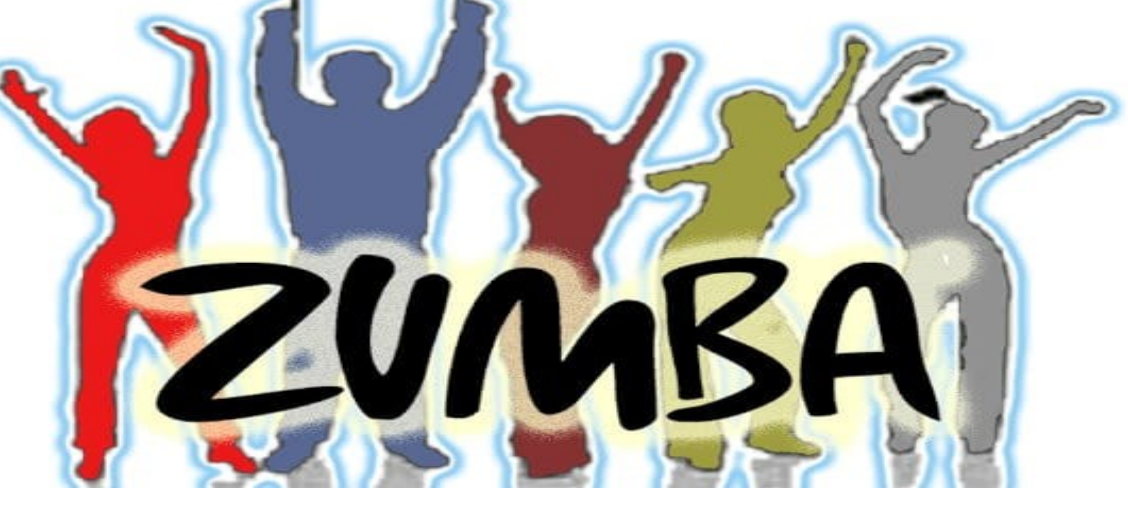
With JENNI COMBS