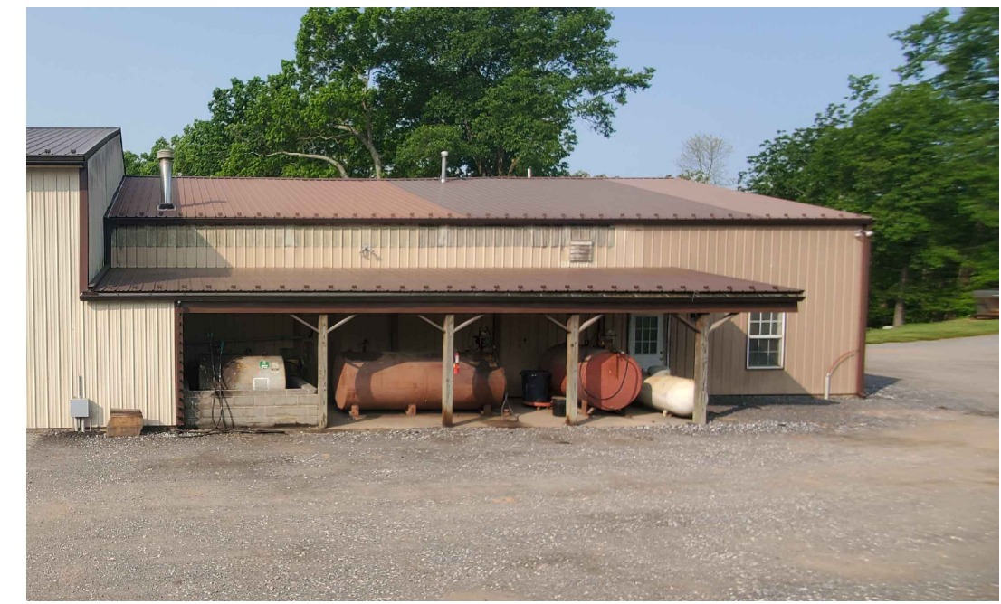
ONSITE FUEL TANK STORAGE DETAIL N.T.S.