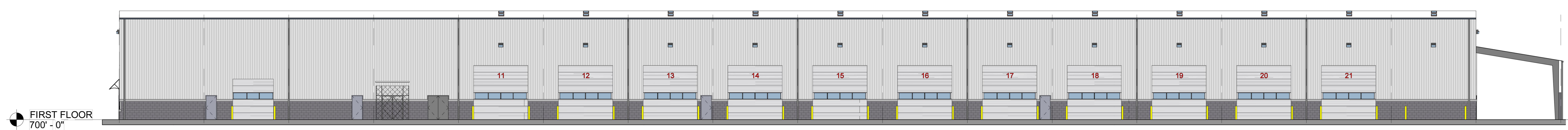
4 NORTH ELEVATION SCALE: 1/16" = 1'-0" A1