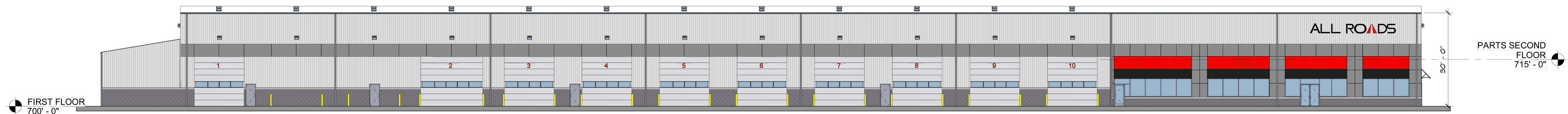
1 SOUTH ELEVATION SCALE: 1/16" = 1'-0" A1

SIGNAGE NOTE FRONT FACADE SIGN 4'-0" X 43'-9" = 175 SF